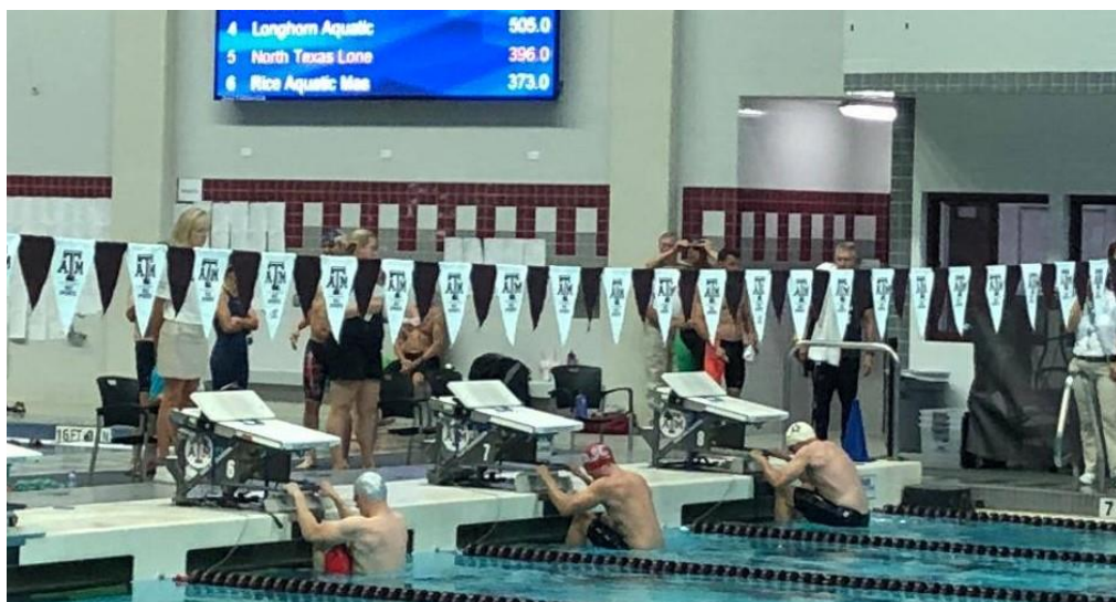
BACKSTROKERS READY FOR THE START AT SOUTH CENTRAL ZONE CHAMPIONSHIPS