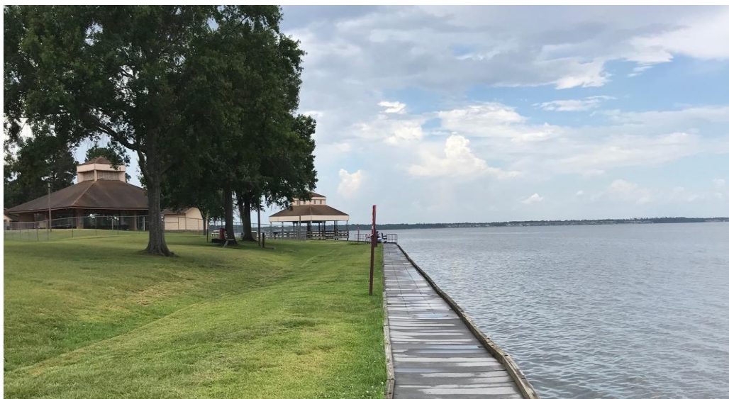
Lake Houston will be the site for the inaugural Swim Across America benefit swim on May 4, 2019.

We will be providing the membership with updates as they become available. We strongly encourage each and every one of you to get involved in this endeavor as either a volunteer, participant, or donor. You can go to swimacrossamerica.org for more information about this fine organization. Together we can make a difference!