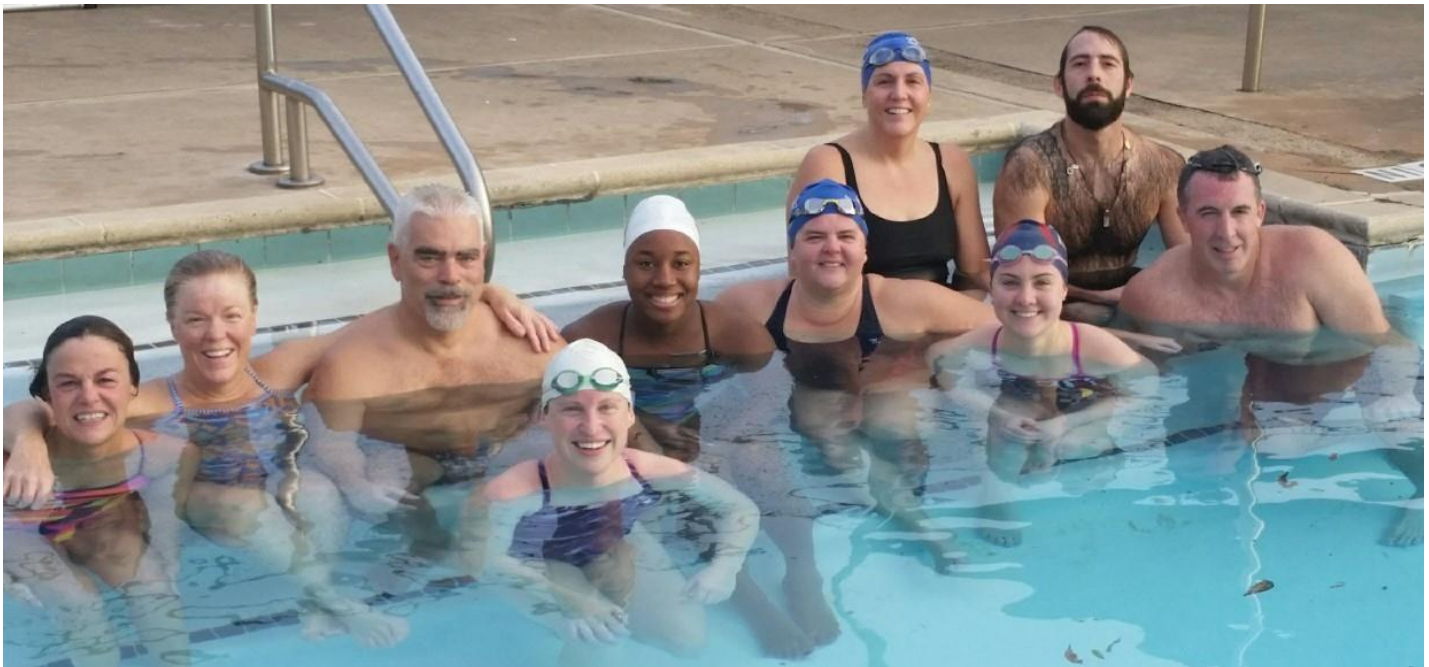
First Colony Masters swimmers enjoy a visit from Olympic Gold Medalist Simone Manuel