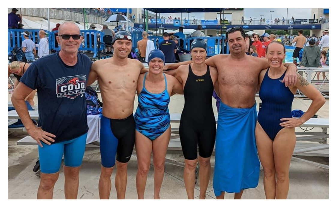
Houston Cougar Masters (COOG) Swimmers Celebrate Poolside After Their Swims

Congratulations to all of our Gulf swimmers who competed at Nationals.